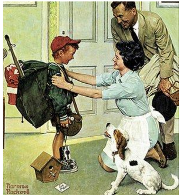
Home from Camp Norman Rockwell

But Rockwell maintained that his depiction of people and moments was our nation the way he saw it: "the America I knew and observed to others who might not have noticed."