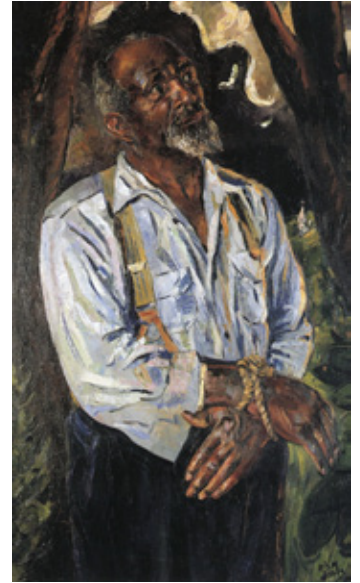
Lois Mailou Jones, Mob Victim (meditation) , Oil on canvas, 1944

her lifetime through exhibitions and representation in important museum collections. Jones also successfully navigated the external and intra-group pressures to be an exponent of her culture's social struggle. She mined protest traditions and racial apologia resulting in powerful psychological portraits including Mob Victim (1945) and Jennie (1943).