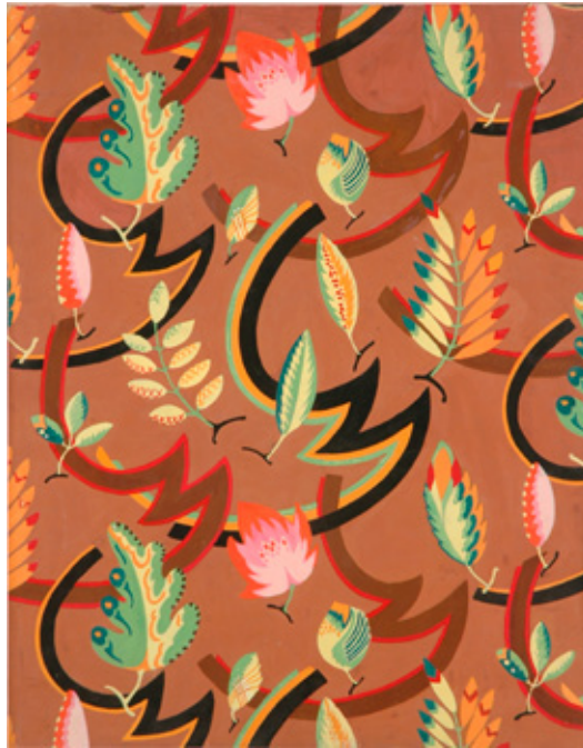
Left: Lois Mailou Jones, Design for Cretonne # 13 , Tempera on paper, c.1932