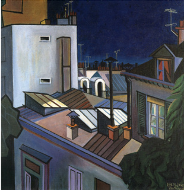
Lois Mailou Jones, Paris Rooftops, Monmartre , Acrylic on canvas, 1965