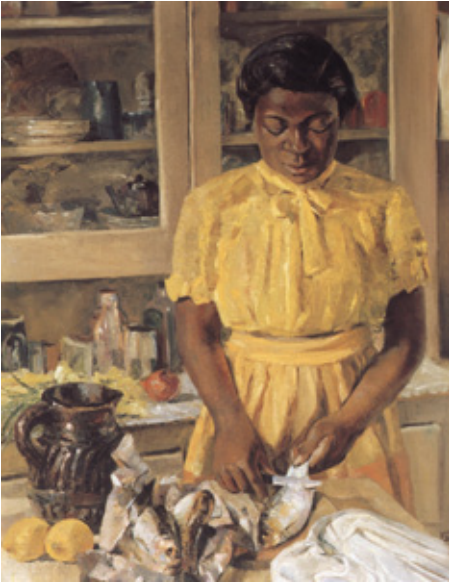
Lois Mailou Jones, Jennie , Oil on canvas, 1943