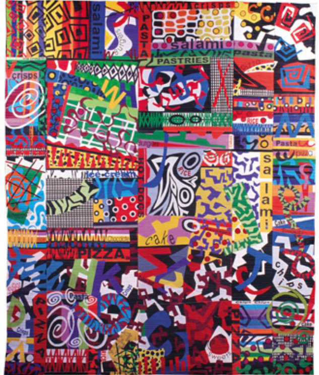
Bethan Ash, Cutting the Carbs—Shedding the Pounds , 2004, ©Bethan Ash