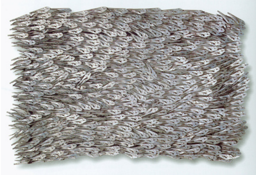
Arman, School of Fishes , Welded steel and vice grips 1982