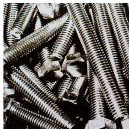
IvanChermayeff, Untitled (set of 78) , 1978, Kodalith