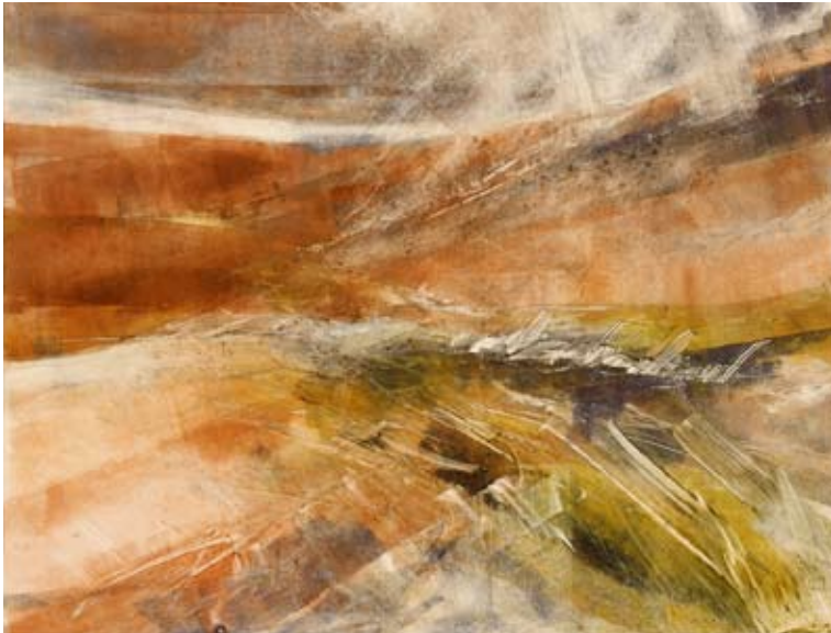
Cecila Stephens, Dried Grasses , 2005