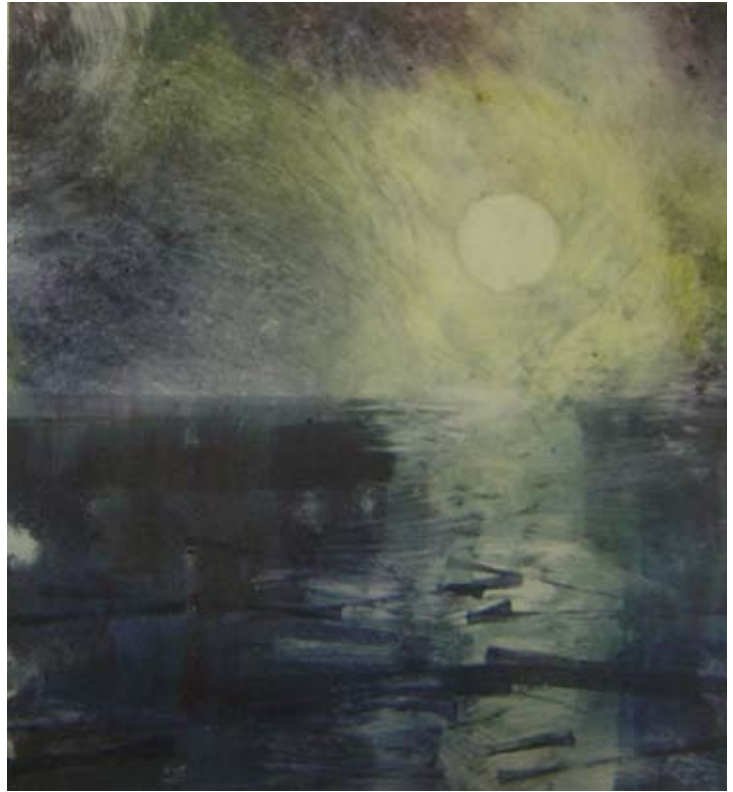
Ivan Frew, White Sun , 2006