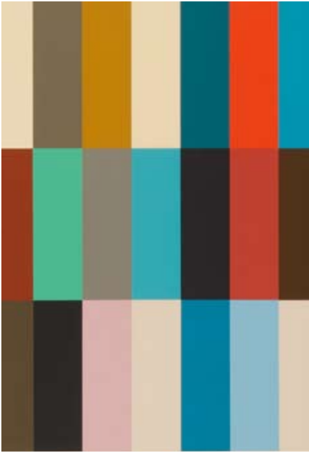
Fiona Joyce, Colour Studies of Outdoor Space II , 2005