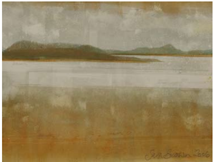
Sara Brown, Misty Blue, Strangford Lough , 2006