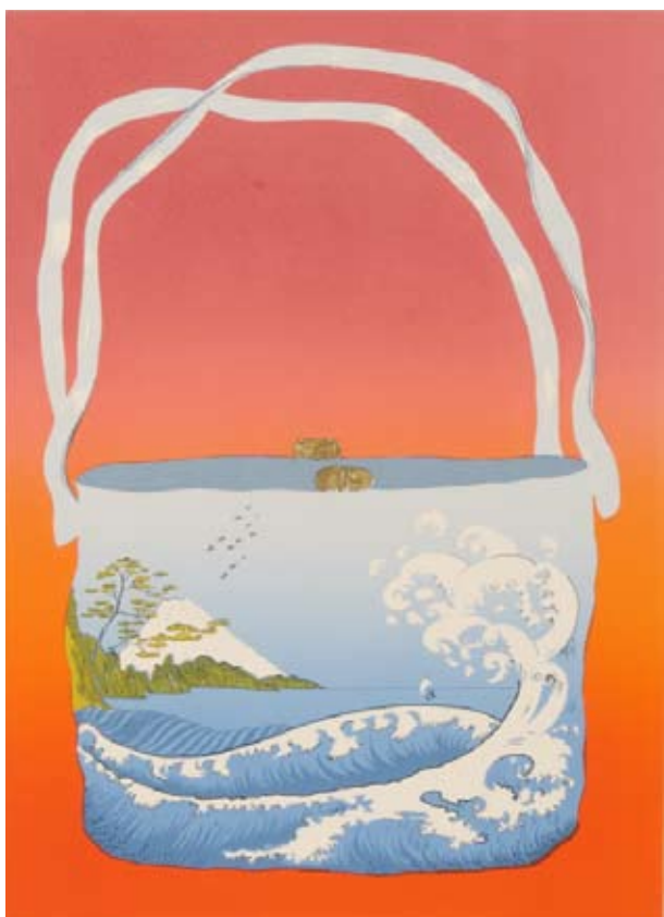
Terry Gravett, Didymaion SP , 2006