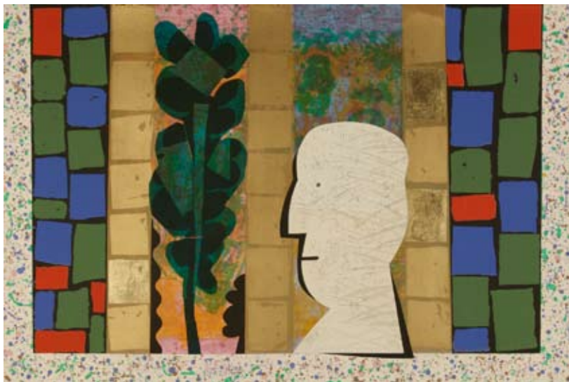
Terry Gravett, Didymaion Collapse , 2006