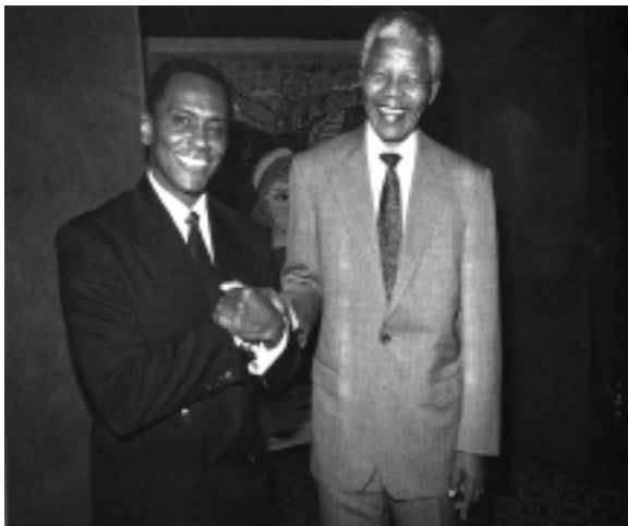
Arthur Mitchell and Nelson Mandela, 1992

1991 - Arthur Mitchell and Royal Ballet director, Anthony Dowell, sign an agreement to help diversify the London company. This results in the creation of the Chance to Dance program, which is modeled after Dance Theatre of Harlem's outreach program, Arts Exposure.