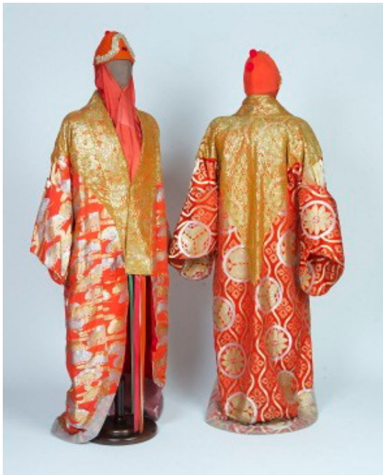
Firebird flag bearers , designed by Geoffrey Holder.

The exhibition was initially presented by Dance Theatre of Harlem and The New York Public Library for the Performing Arts at Lincoln Center, exhibiting the company's rare costumes, photos, and other memorabilia. The California African American Museum supplemented the exhibition with the staging of costumes and the addition of documentary video excerpts, and added life-sized banners and other imagery to illuminate the forty years of history during which Dance Theatre of Harlem and Arthur Mitchell received over 300 official citations for excellence.