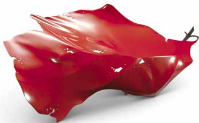
Muramoto Shingo, Wing of Foliage: Bending in the Wind , 2015, lacquer, bamboo, hemp cloth. 14 x 41 1/8 x 18 1/4 in. Minneapolis Institute of Art, The Curtis Dunnavan Fund for the Purchase of Asian Art, 2017.11.

Muramoto's technical mastery and exceptional lacquer artistry are widely recognized, and he has been commissioned to work on culturally significant buildings. For example, he helped restore a part of Tokyo's Zōjōji temple (1632), which is registered as an Important Cultural Property, and he restored the gold leaf at Akasaka Palace, now Japan's State Guest House, where visiting foreign dignitaries stay.