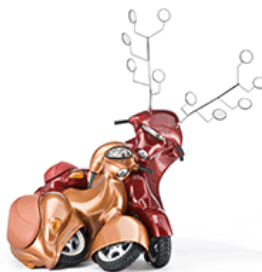
"The Lovers" (2011) by Patricia Piccinini, fiberglass, auto paint, leather, scooter parts, part of Hosfelt Gallery's 20th anniversary exhibition.