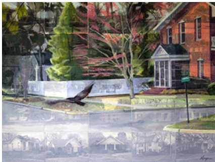
"Buzzard in the Neighborhood" by Randy Hayes, oil on photographs, canvas, showing at Theme + Projects.