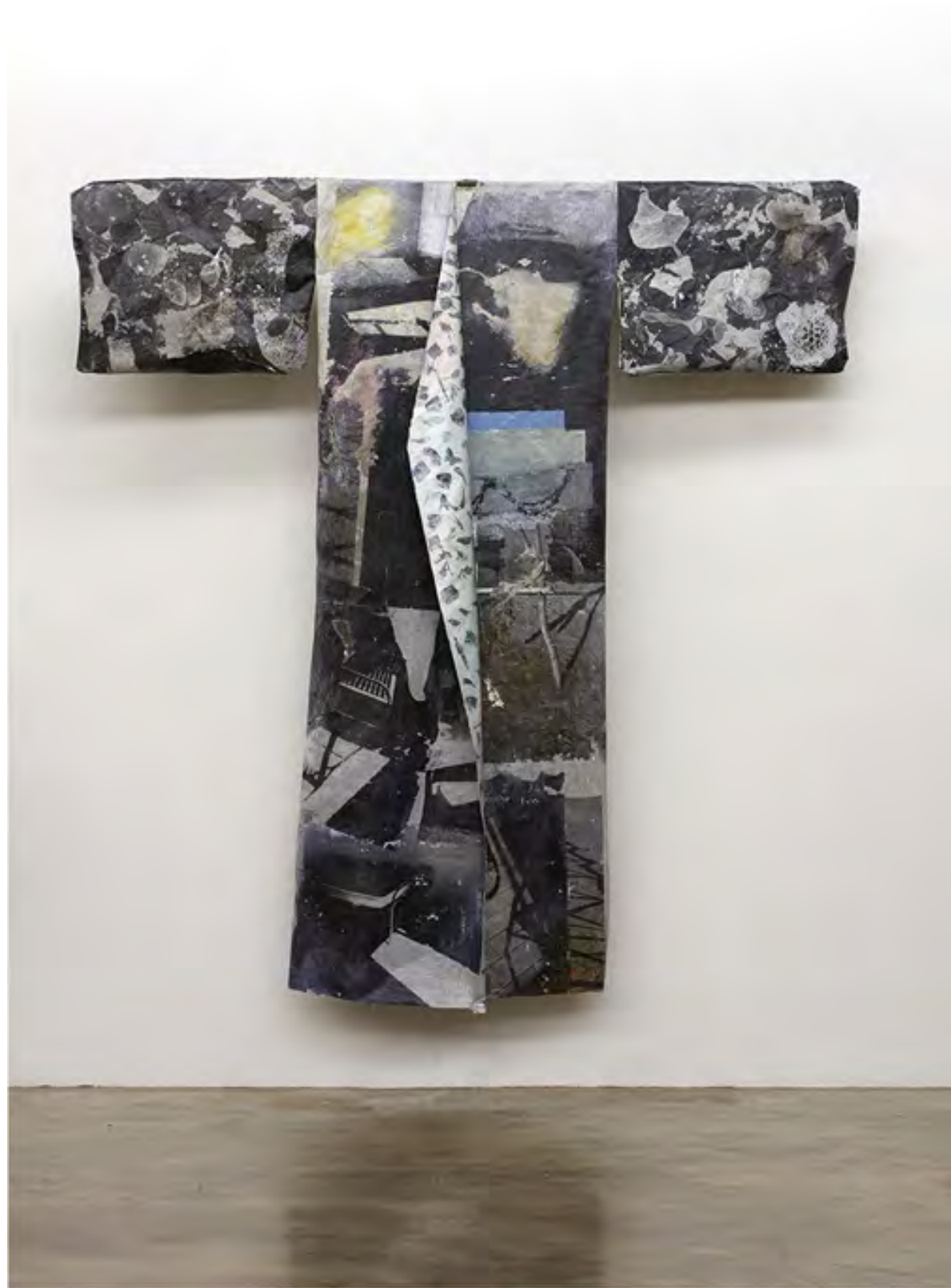
6. Peter Liashkov, Manzanar Kimono , 2014 Print transfer, acrylic, ashes on propylene fabric, 11" x 6", Photographed by Ellen Gianportone, Image courtesy of Ellen Gianportone, © Peter Liashkov.