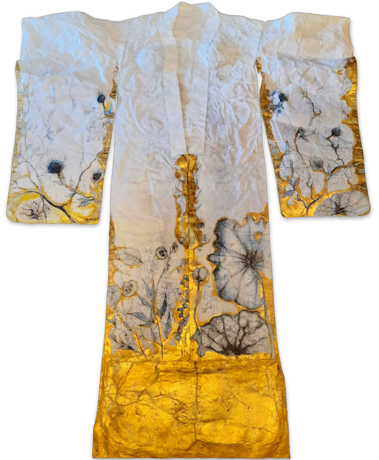
7. Maria Papatzelou, Kawakami Mythical Dream , 2021, Japanese handmade paper (washi), pigments, aquarelle pencils, monoprints, collage with old Japanese maps and sumi-e painting, 62.9" x 59.8", Photographed by Maria Papatzelou, Image courtesy of Maria Papatzelou, © Maria Papatzelou.